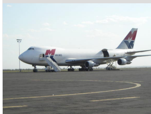
Ground crew load Tanzanian grown produce onto a TFHL chartered flight out of Kilimanjaro International Airport.