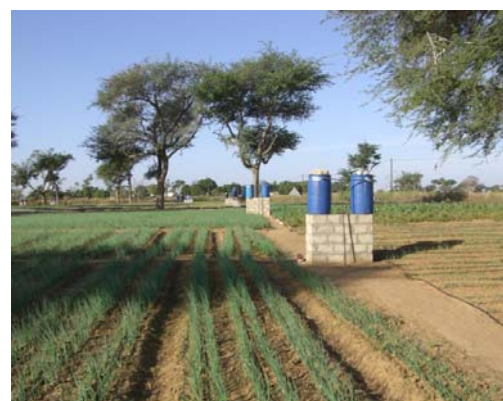
AMG onions in Keur Yaba-Senegal