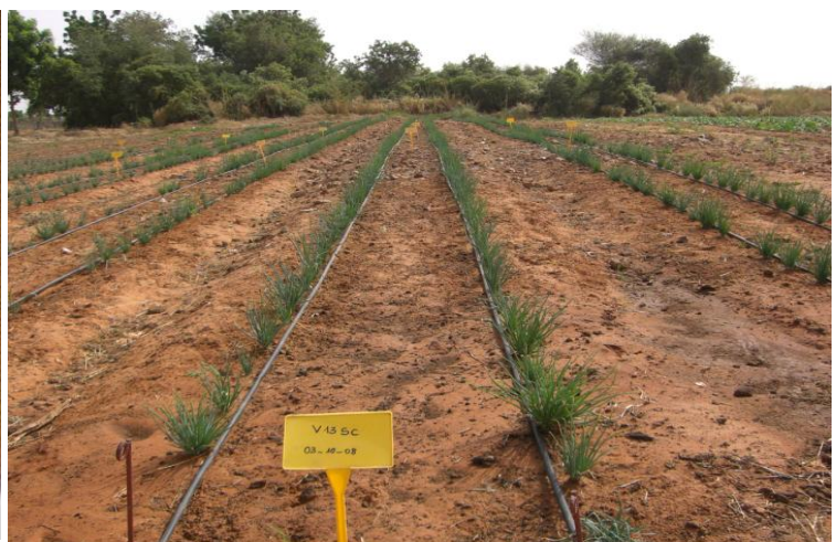
Seed production of improved Violet de Galmi onion