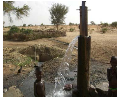
Left-AMG clusters five meters below the dam=hydraulic pressure Center-solar pumping Right-free flowing water from an artesian borehole All are sources of alternative energy to be used by the AMG