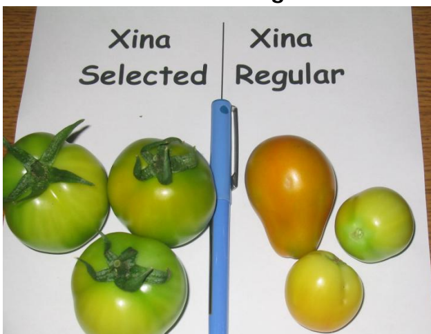
Icrixina tomatoes for the rainy season

So far ten new vegetable varieties have been selected.