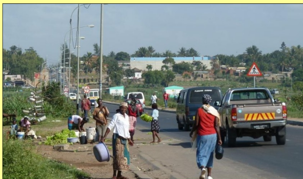
Vegetable street vendors in Maputo green belt

( http://www.globalhort.org/network-communities/urban-horticulture/#news-272 )