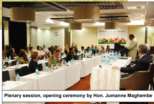
Plenary session, opening ceremony by Hon. Jumanne Maghembe