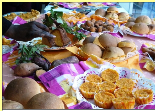
Orange flesh sweet potatoes promoted by CIP in Eastern and Southern Africa