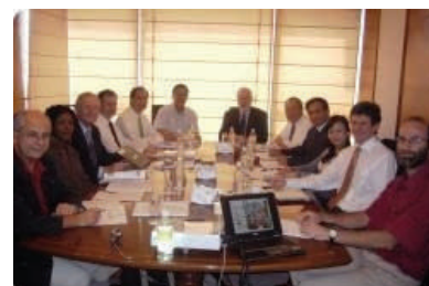
GlobalHort Board of Directors