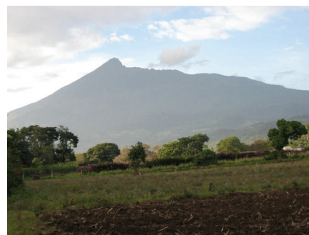
AVRDC-RCA and Mt. Meru