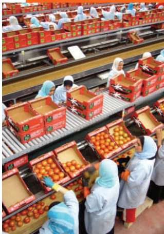
Packing fruits and vegetables near Agadir, Morocco

The congress will provide information on the trends in horticultural trade, promote the consumption of fruits and vegetables within local communities for improved health and promote horticultural production practices that are sustainable and environmentally friendly.