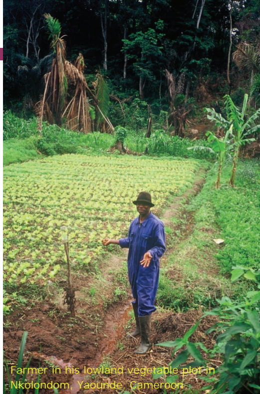
Farmer in his lowland vegetable plot in Nkolondom, Yaounde, Cameroon